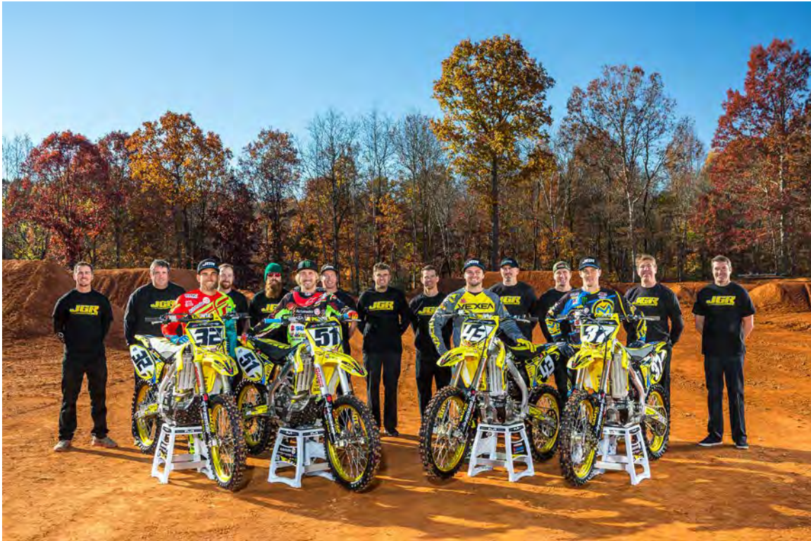
The Autotrader/Suzuki/JGRMX Team at the 2017 team photo shoot.